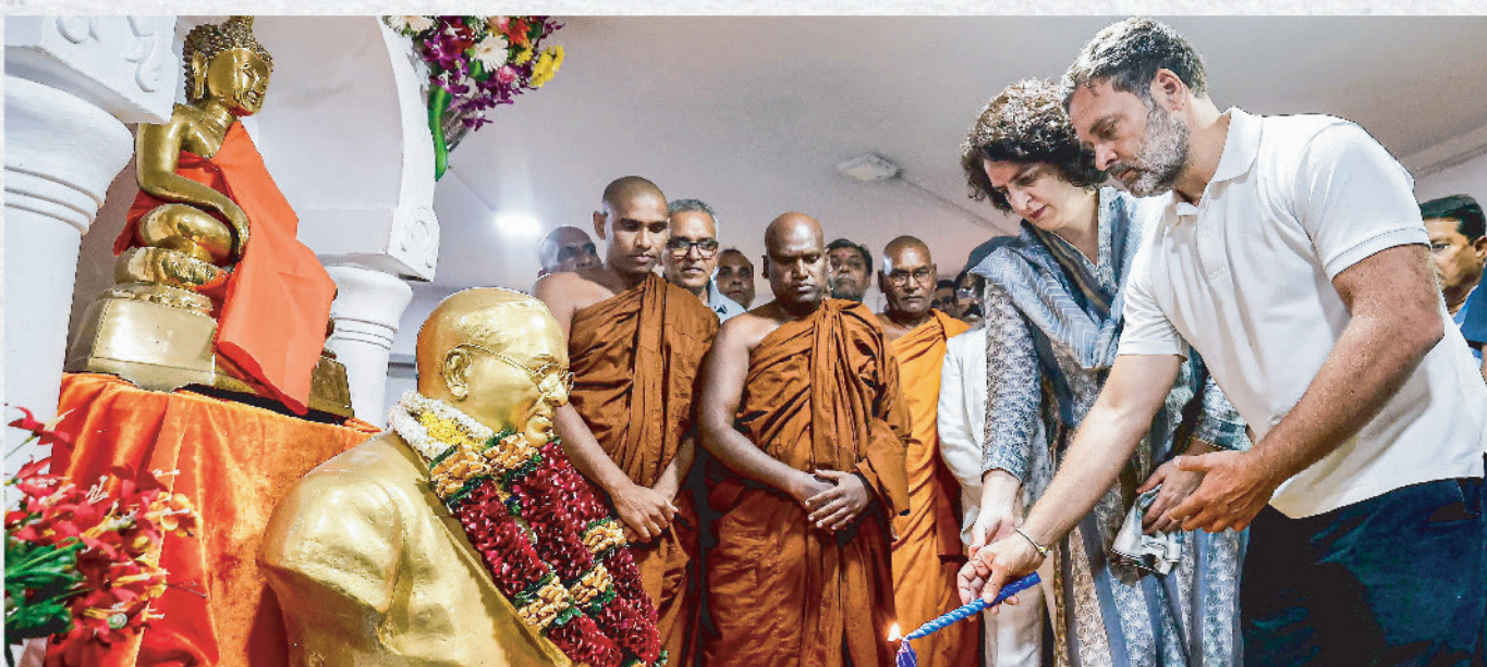
Paying Tribute to Babasaheb at Chaityabhoomi.

What Ambedkar ji gave this nation, not just for us but for future generations, is his sweat and blood, embodied in the Constitution - a legacy we will never let die.