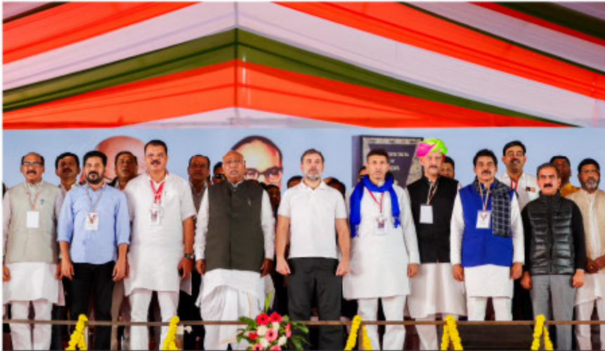
Speaking at the Jai Bhim, Jai Bapu, Jai Samvidhan rally in Dr. Ambedkar Nagar (Mhow), Madhya Pradesh.