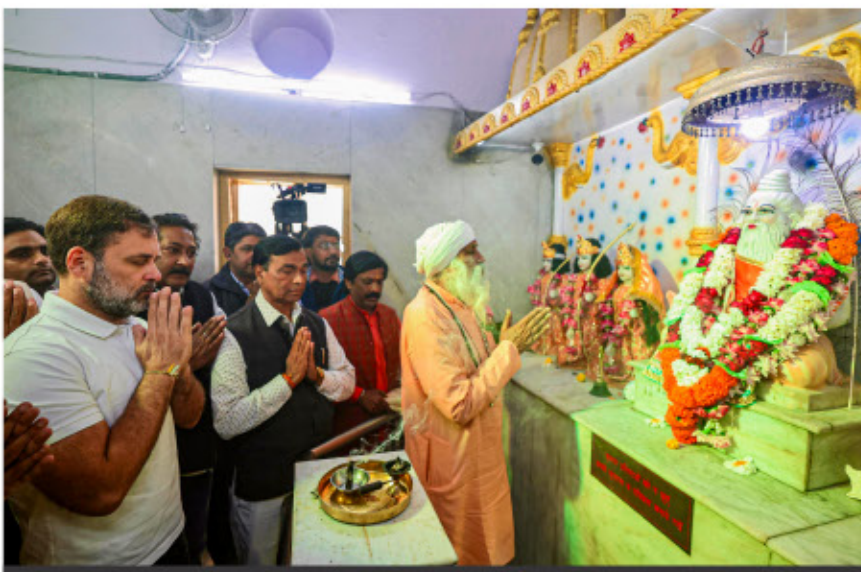
Paying respect at the Mahashri Valmiki Mandir in Delhi.