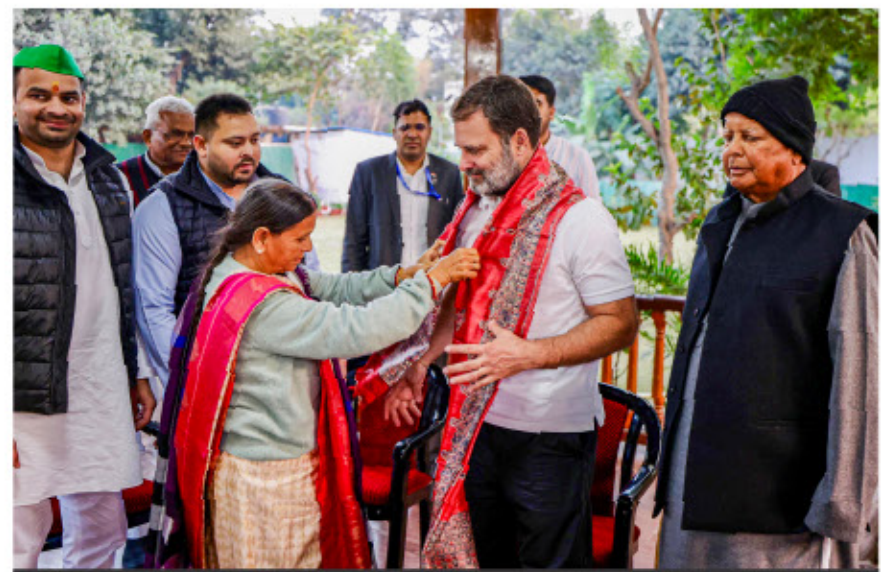
Visiting Lalu ji's residence in Patna, Bihar.