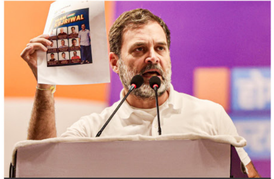
Speaking at a rally in Delhi.